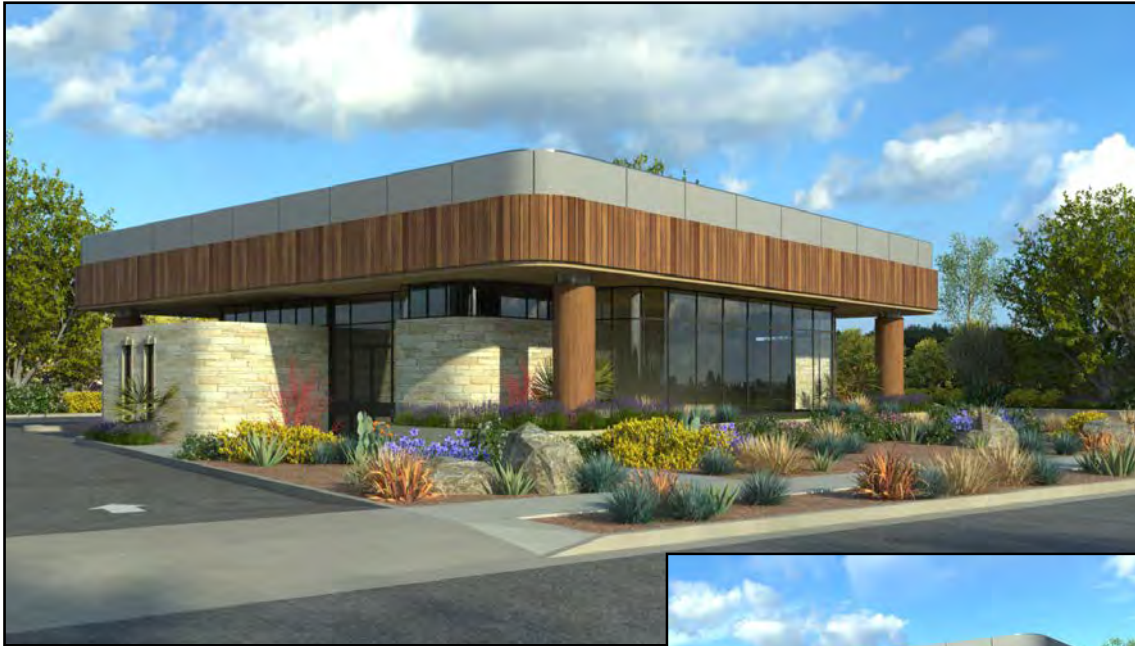
Renderings depict potential cosmetic enhancements to the existing building.